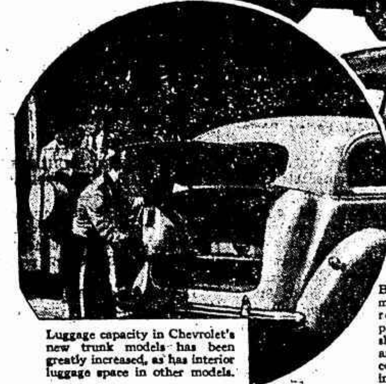
Beauty and utility mark the new Chevrolet instrument panel. The windshield is of greater area, with narrow corner posts, affording better vision.